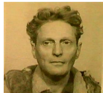
Mug-shot of Late Reverend Richard Wurmbrand when held in the Jilava prison, in communist Romania.