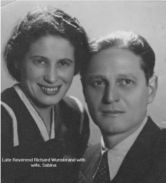
Late Reverend Richard Wurmbrand with wife, Sabina

“And call upon Me in the day of trouble: I will deliver thee, and thou shalt glorify Me.”