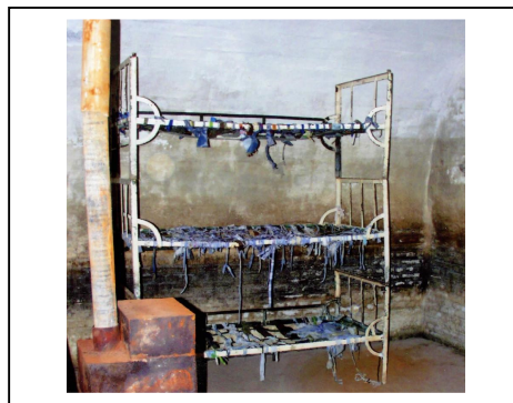
Prison cell with bunk-beds with no mattress, prisoners were obliged to sleep on. Stove for show only, never heated in cold winters.