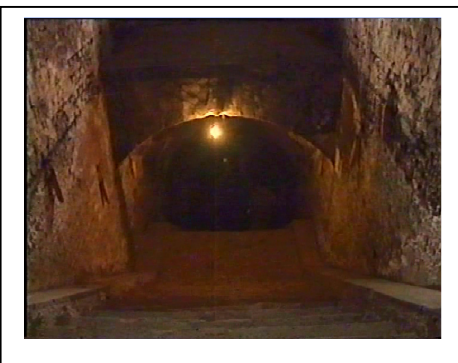
The Communist Jilava Prison. Entrance to the underground cells.