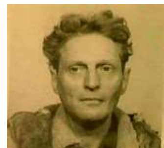
Mug shot of Late Reverend Richard Wurmbrand when held in the Jilava prison.