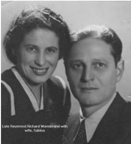
Late Reverend Richard Wurmbbrand with wife, Sabina

Email: hfr@helpforrefugees.com ; Website: http://helpforrefugees.com