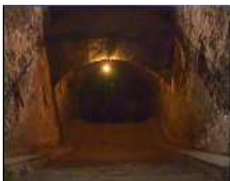
The Communist Jilava Prison. Entrance to the underground cells.

Then I read to him the story of the resurrection. When he heard this wonderful news that the Savior arose from the tomb, he slapped his knees and swore. Again, he rejoiced. He shouted for joy: "He is alive! He is alive!" Again, he danced around the room, overwhelmed with happiness! I said to him, "Let us pray!" He fell on his knees together with me. He did not know our holy phrases. His words of prayer were "O God, what a fine chap you are! If I were You and You were me, I would never have forgiven You your sins. But You are really a very nice chap! I love You with all my heart." I think that all the angels in heaven stopped what they were doing, to listen to this sublime prayer from this Russian officer. This man received Christ wholeheartedly. He knew that he would lose immediately his position as an officer, that prison and perhaps death in a Soviet jail would almost surely follow. He gladly paid the price. He was ready to lose everything.