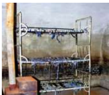
Prison cell with bunk-beds with no mattress, prisoners were obliged to sleep on. Stove for show only, never heated in cold winters.