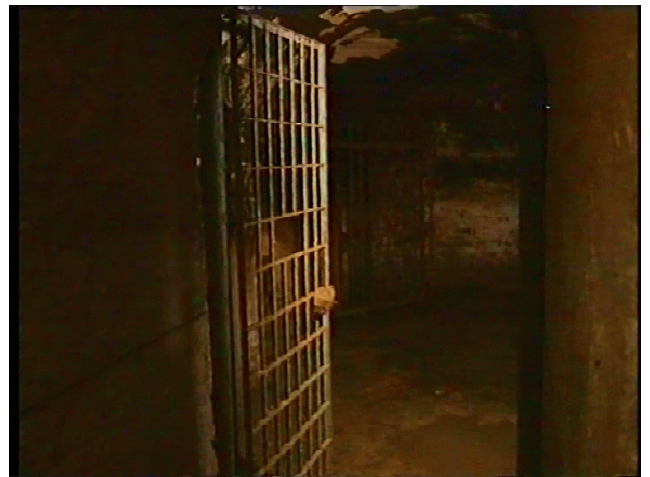
Underground cell Jilava communist prison, Romania. Prisoners had to sit on the wet, even at certain times, flooded floor.