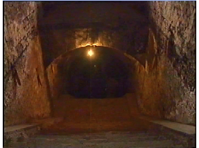
Entrance into the underground cells of the Jilava prison, during communism in Romania.